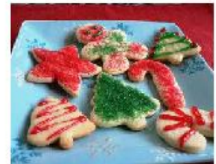
Baked Home Made Cookies